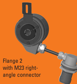
Flange 2 with M23 right- angle connector