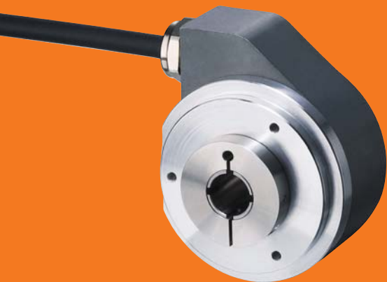
One rotary encoder – for all geared motor applications