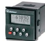
Time relay LCD 910

Can be used for ON/OFF Delay, clock-pulse generator, 3 control modes (level, edge, edge-trig.), thus 24 programmable operation are possible.