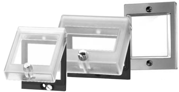
Transparent cover with key lock